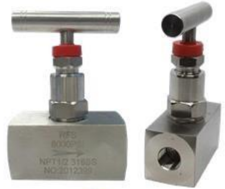
Female x Female 6000 PSI Needle Valves