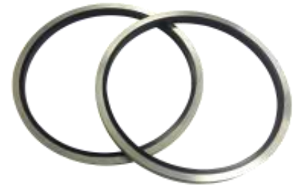
GS Bonded Seals