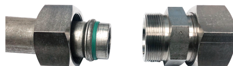
Figure 2 Walform Seal on Tube