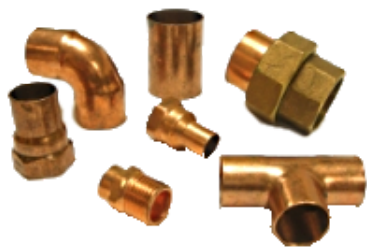
Figure 1 Copper Fittings

Copper fittings are used to connect with copper pipe or tubing in pipe works. The available Nibco copper fittings series are Wrought Fittings (600 series) and Cast Fittings (700 series). Wrought fittings are available in an extensive range of types and size while cast fittings are only available in standard tube sizes and in a limited type to supply for mechanical and plumbing systems. The design and standard of copper fittings is according to ASME B16.22 and B16.24.