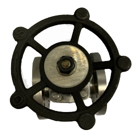
Figure 2 JIS 10K Cast Iron Globe Valve

The available size for the globe valve is ranged from 1" to 6", subject to material. JIS 10K flange end globe valve can withstand up to 10kg/cm<sup>2</sup> which is equivalent to 150 PSI working pressure.