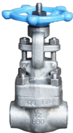
Figure 1 Threaded End SS316 Gate Valve (800 PSI)