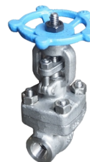
Figure 2 Threaded End SS316 Gate Valve (800 PSI)

For SS316 gate valve, it is only available in NPT (National Pipe Thread) female thread or BSPP (British Standard Pipe Parallel) female thread. For A105 gate valve, it is available in NPT female thread or Socket Weld connection. For the female thread gate valve, it needs a male thread of the same connection end to screw in to the gate valve. For socket weld connection, it needs a plain end pipe to connect.