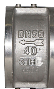
Figure 2 PN40 Dual Plate Check Valves

The size for the dual plate check valve is ranged from 1 1/2" to 6". For sizes above 6", do check with us for indent basics. It can withstand up to 40 bar, which is 580 PSI working pressure.