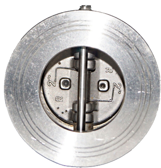
Figure 1 Dual Plate Check Valves

Wafer type dual disk check valve is designed to permit fluid flow in one direction only and prevent back flow from pipeline. It is designed and manufactured according to API 594 standard. Inspection and testing had been carried out according to API 598 standard.