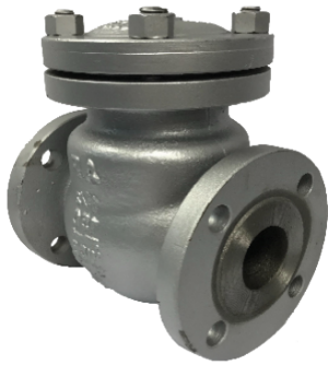
Figure 1 ANSI 150# Cast Steel Swing Check Valves