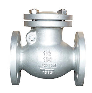
Figure 1 ANSI 150# SS316 Swing Check Valve