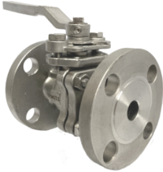
Figure 1 JIS 10K SS316 Flange End Ball Valves

JIS 10K SS316 flange end ball valve is a JIS standard flange type ball valve that is used for shut off application in a pipeline. It is designed and manufactured according to JIS B2071. Inspection and testing had been carried out according to JIS B2003 standard.