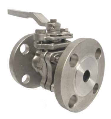
Figure 1 JIS 10K SS316 Flange End Ball Valves