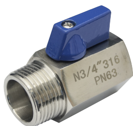
Figure 1 M x F SS316 Mini Ball Valve

Mini ball valves are suitable to use in small, confined spaces, where larger valves are not necessary. It is a quarter turn ball valve where the handle can be pivoted 90 degrees for open position or close position. They are usually installed for residential and light commercial applications in domestic hot and cold water systems, natural or bottled gas and compressed air systems.