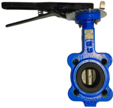
Figure 1 ANSI 150# Cast Iron Lug Type Butterfly Valve

Butterfly valve is a quarter-turn valve that is used to start, stop, and regulate flow in a pipeline system. It has a disc which is mounted on a shaft. By turning the handle in quarter turn, the disc will turn to open position or close position. When the valve is turned to open position, the disc moves away from the seat and is parallel to the flow. In the close position, the disc is perpendicular to the flow and sealed by the seat. Partial rotation of the handle is applicable for throttle application. It is designed and manufactured according to API 609 standard. Inspection and testing had been carried out according to API 598 standard. Butterfly valve is widely installed on solid liquids applications such as oil and chemical, water supply, fire protection, and wastewater treatment at low pressure.