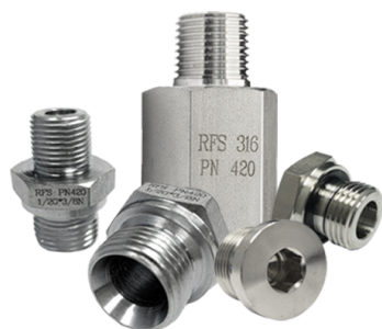
Figure 1 Adapter Fittings