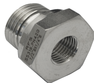
Figure 2 Adapter Bushing C/W ED Seal

Adapter fittings are available between 1/8" to 1 2". Sleeve has two different reading measurements, metric size (mm) and inch outer diameter ("OD). Sleeve size is available from 3mm to 50mm and 1/8" to 2". Fitting sizes are designated by the corresponding outside diameter of the tubing for the various types of tube ends.