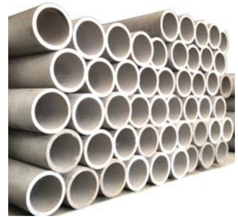
Stainless Steel Pipes

Tubes made of TP316 & TP316L are suitable for arc welding according to usual techniques. The welding filler should be selected in accordance with DIN EN1600 and DIN EN 12072 part 1 taking into account the type of application and the welding technique.