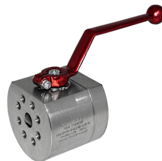
KH Type SAE Flange Ball Valve 210/420 Series

The connection of the SAE flange ball valve is in accordance with ISO 6162-1 and ISO 6162-2, thus, SAE flanges are required for connections. Typically, there are four types of connection for SAE flange: S/W (Socket Weld), B/W (Butt Weld), NPT (National Pipe Thread), and BSPP (British Standard Pipe Parallel).