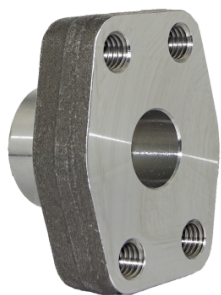
Figure 3 Flat Side SAE Flange

For the connections of SAE flanges, it is available in socket weld connection where the pipe is inserted into the recessed area of SAE flange.