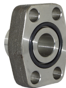
Figure 2 Oring Side SAE Flange

For Code 61 series, SAE flanges are available in nominal size ranging from 3/8"NB (DN10) to 5"NB (DN125). While for Code 62 series, SAE flanges size are available from 3/8"NB (DN10) to 3"NB (DN80).