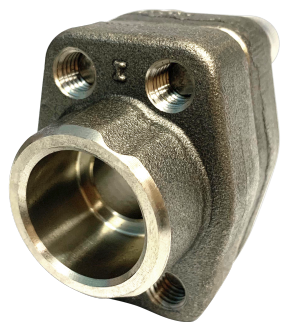
Figure 1 S/W SAE Flanges