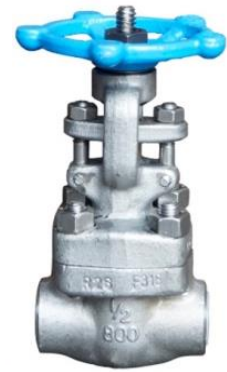
Threaded End SS316 Gate Valves 800 PSI