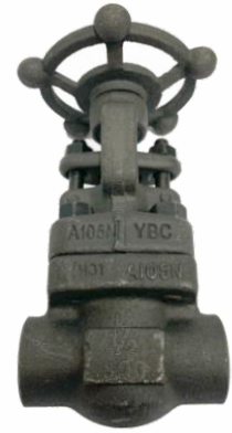
Socket Weld A105 Gate Valves 800 PSI