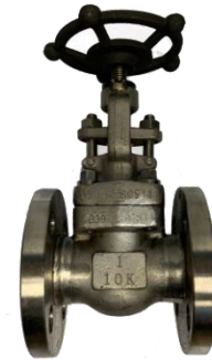
JIS 10K SS316 Flange End Globe Valves