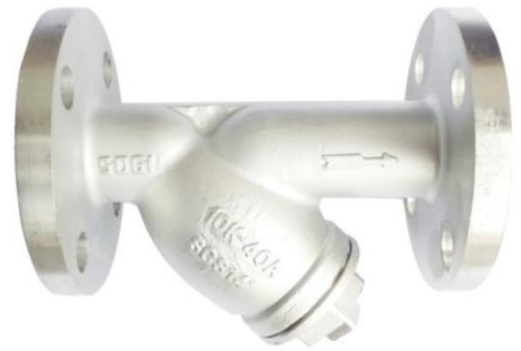
JIS 10K SS316 Flange End Y-Strainers