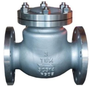
JIS 10K SS316 Flange End Swing Check Valves