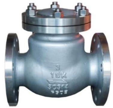
JIS 10K SS316 Flange End Swing Check Valves