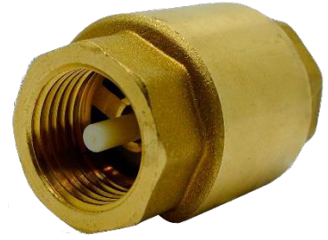
Brass Spring Check Valves