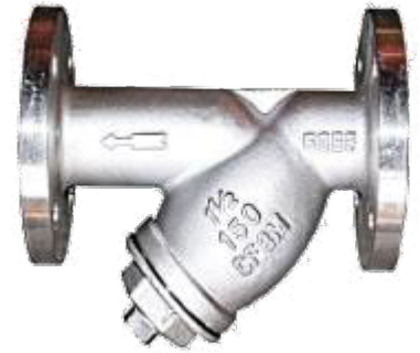
ANSI 150# SS316 Flange End Y-Strainers