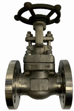
ANSI 150# SS316 Flange End Gate Valves