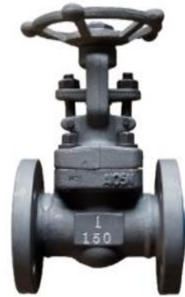
ANSI 150# Flange End Gate Valves