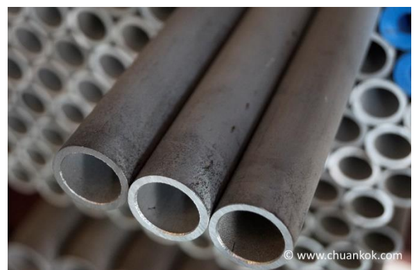
Figure 2: Annealed & Pickled Stainless Steel Pipe

Pipes are supplied in 1 type of finishing which is Annealed and Pickled. Annealing is a heat treatment that alters the physical and chemical properties of the material. It also increases the ductility and reduces the stainless steel pipe hardness. Pickling is a metal surface treatment that contains acid to remove the impurities on the pipe surface.