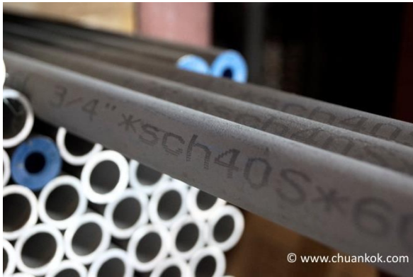
Figure 3: Stainless Steel Pipe "SCH" thickness