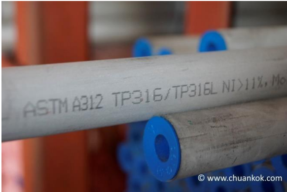
Figure 1: Stainless Steel Pipe Specifications

One of the most supplied in Chuan Kok's product range is stainless steel pipes. Stainless steel pipes are consumed in high performance fluid or gas line application. Most clients requests for seamless stainless steel pipes due to their corrosion resistance and ability to withstand pressure.